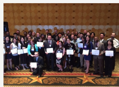
2016 Travel Awardees