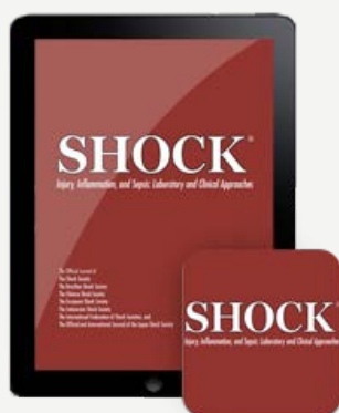
SHOCK for the iPad®