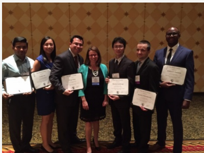
2016 New Investigator Awardees