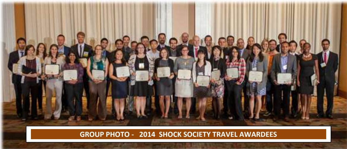
GROUP PHOTO - 2014 SHOCK SOCIETY TRAVEL AWARDEES