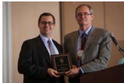
2014 Research Fellowship Recipient

Secondly, the society has created a new award entitled the " Research Investigator Award for Early Scientists. " >$20,000 will be provided the awardee over one year. This award is specifically for post-doctoral fellows (individuals who have already obtained their PhD) or residents/clinical fellows (individuals who have already obtained their MD) but are not necessarily faculty at their institution. The proposed research should focus on developing new knowledge related to the biology of trauma, shock and/or sepsis. Applicants must be members of the Shock Society at time award is reviewed. Please see following web-link for details. http://www.shocksociety.org/-new-award-for-early-scientists